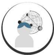
For Off-Grid User