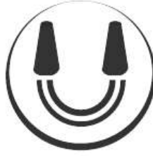
Overload & Short Circuit