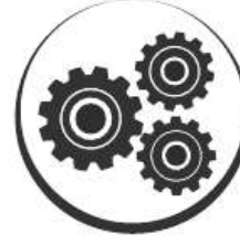
Comprehensive Product Model